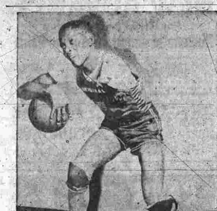
Coach [Name], above, considered the greatest concern of the North Carolina basketball team.